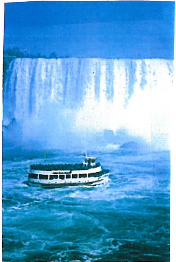
The Maid of the Mist

ORAL EXERCISE – You don't listen to the tape at all, you just watch the video and try to imagine the journalist's comment and the fireman's testimony. Of course you have to put into relief the dangerous and heroic aspects of the situation. You also have to remember that the event takes place in a unique and incredible spot. Then when you imagine the fireman's testimony try to stick to his lips movements, don't make speeches shorter or longer than the actual speeches.