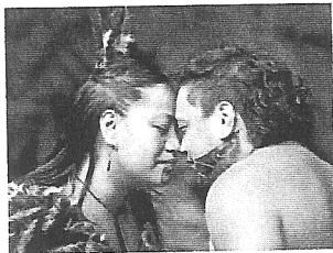
Queen of New Zealand. a Governor General. New official anthems: "God New Zealand".

Zealand from Polynesia. New Zealand was first discovered by Europeans in 1642 when Dutch sailor Abel Tasman arrived. He left New Zealand because several members of his crew were killed by Maoris. Then in 1769 English Captain James Cook arrived and mapped the land.